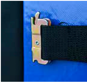
E or F Straps