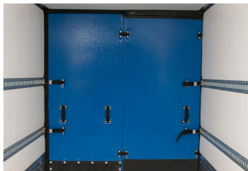
CoolGuard Z features flexible skid guards and 22oz vinyl perimeter seals. Pictured: BH2000 Z in bi-fold position

The Z Shape bulkhead is the space optimizing, temperature-controlling portable bulkhead. With an odd pallet configuration, the Z Shape optimizes space and conserves energy. With even pallets, it easily converts to a traditional traverse design.